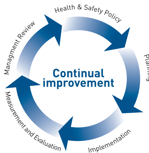
Fig 1. Typical health and safety management model

To receive formal acknowledgment and recognition for its health and safety management system, an organization may choose to apply for SafetyMAP Certification.